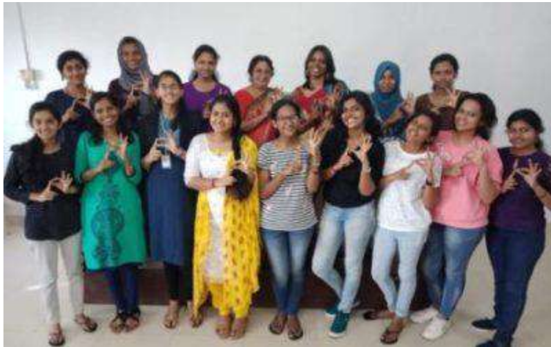
Flood Relief Activities in August 2018: Students flood relief activity consolidated report