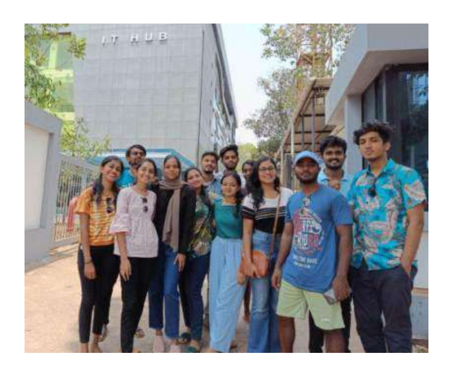
Talk on "Personal Health"