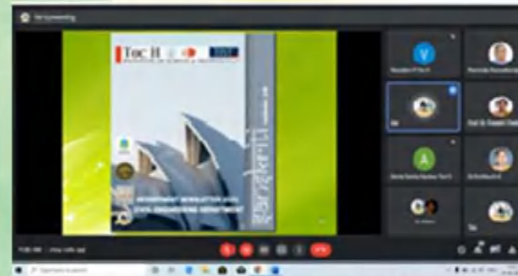
Inauguration of RACHANA activities 2021-22