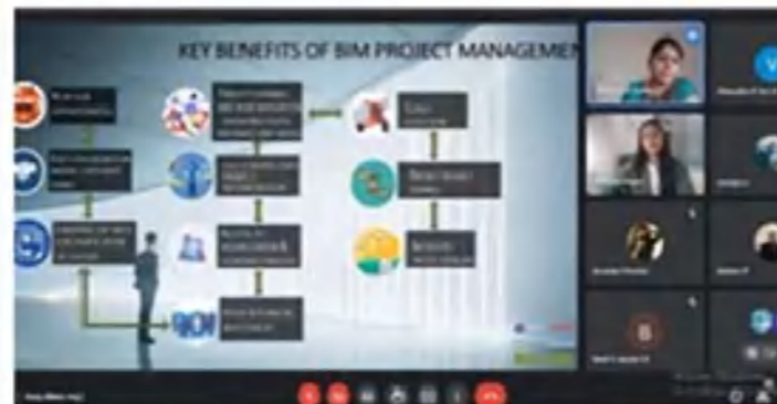
Webinar on the topic “Future of Construction