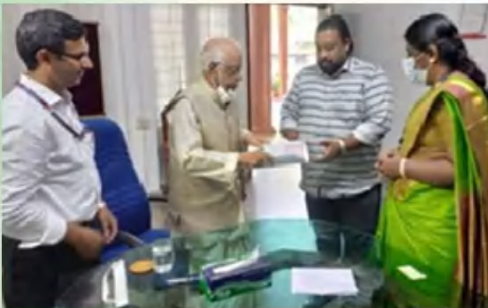
MoU with Habilete Learning Solutions

Department of Civil Engineering, TIST has signed an MoU with Habilete Learning Solutions, a premier institute for industry skill development on 21st May 2022.