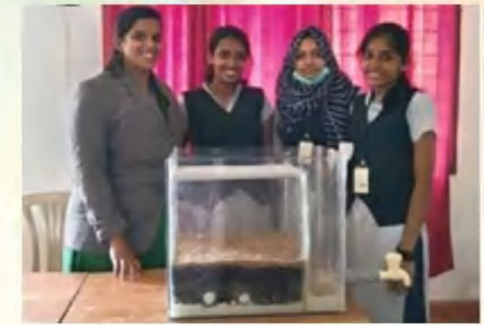
Rapid Sand Filter using Rice Husk and Groundnut Shell

Department of Civil Engineering, TIST organized slogan making competition as part of World Environment Day, 2022 in association with IGBC and IIC of TIST.