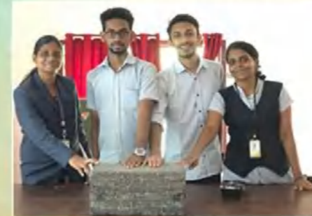
Light Weight Concrete Block with Cloth Pieces

An exhibition on prototypes developed by final year students (2018-2022) was organized by the Civil Engineering department in association with the Institution’s Innovation Council(IIC) of TIST on 28th May 2022. HoD and all staff of the department attended the exhibition. Prototypes of Light weight concrete blocks with cloth pieces and Rapid sand filter using rice husk and groundnut shell was the main attraction of the exhibition.