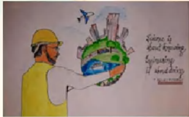
Shabna K Ahammed, 2019-23, CE

Department of Civil Engineering celebrated World Water Day on 22nd and 23rd March 2019. A two days workshop was conducted on the theme “leaving no one behind” as part of Techfest, Techshila 2K19. The workshop was enlisted in the event list of UN world water day celebration website. Poster Making and Photography competitions were conducted.