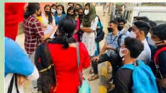
Survey for Performance Evaluation of Kochi Water Metro

2017 Admission students of Civil Engineering Department were officially graduated on 22nd April 2022.