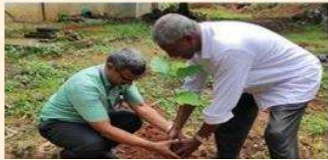
World Environment Day 2024

As part of the World Environment Day, on 5 th June 2024, Civil Engineering Department have initiated Indoor plant decor and Organic farm in the department.